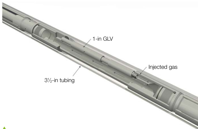
▲ Conceptualization of 1-in Gas Lift Valve within Straddle